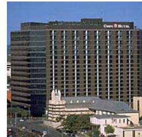
Omni Downtown Austin

TATOA's 8th Annual Conference— Hot Topics in Telecommunications, is set for Thursday and Friday, August 14 and 15 at the Omni Downtown Austin Hotel. Conference Registrations will remain at last year's rates of $100 for members, $200 for non-members.