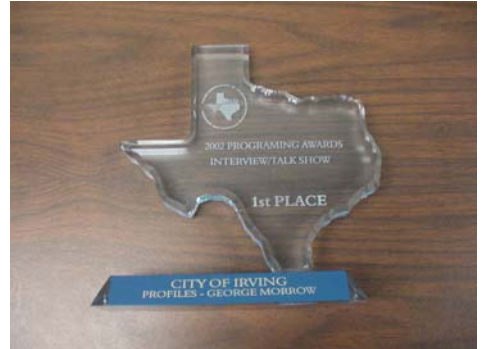
First Place Government Programming Award

TATOA is looking forward to expanding its sessions on PEG